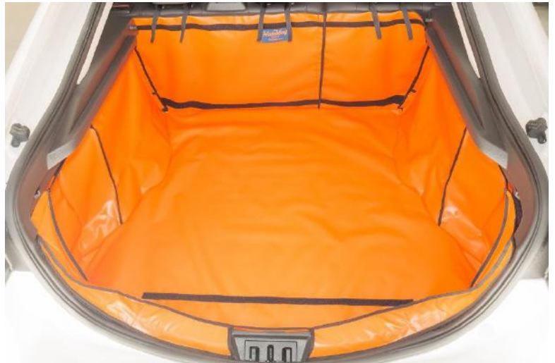
Split bootliner with bumperflap, seatflap & extension prep